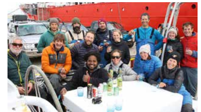
Job done: the assembled team in the cockpit of Pelagic Australis on their return to Port Stanley, Falkland Islands