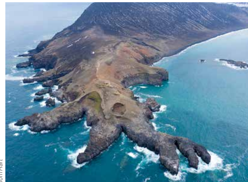
Drone flight above the chinstrap colony on Nattriss Point, Saunders Island

The South Sandwich Islands Expedition had sailed with us from Port Stanley in the Falklands on 30 December. Specialists for volcanology, climate change, penguin