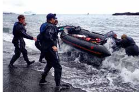
Turning the inflatable around immediately is the only way to prevent flooding. Dry suits are de rigeur