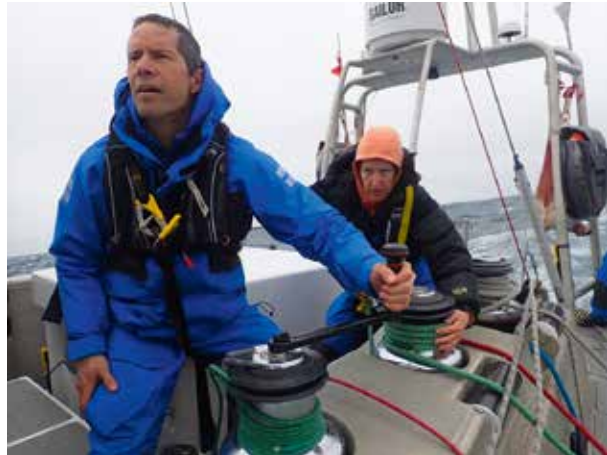
Researchers learning the ropes on the way to South Sandwich

‘I was bracing myself for days hove to offshore in gale conditions’