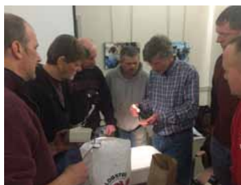
Image 1. Harvesters from Harpswell and Brunswick learn about bivalve biology and ecology.

The research component of this project involves: identifying potential barriers to the successful adoption of aquaculture, assessing general attitudes towards aquaculture, and an overall assessment of the course itself. These will help tailor future classes and can potentially facilitate harvester's successful transition to aquaculture.